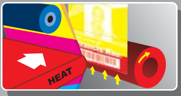
Dye diffusion thermal transfer (D2T2 technology)