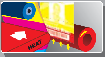
Dye diffusion thermal transfer (D2T2 technology)